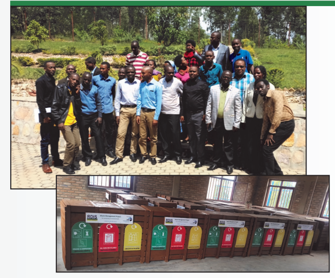
Participants of awareness creation workshop in Shyogwe; Waste bins ready for distribution

Our Vision: A Holy Soul in a Healthy Body. Our Mission: To safeguard environment, increase production aiming at sustainable and holistic development.